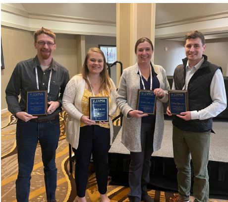
2022 Power of 10 Class