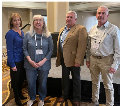
2023 Lifetime Members